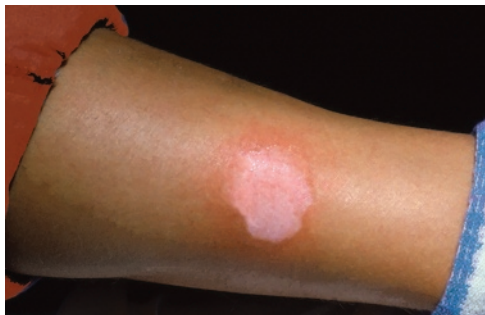
A small burn caused by contact with a hot motorcycle exhaust pipe, postburn day 0.

and rapid diagnosis over large surfaces. 58-61 Even more sophisticated techniques, such as the use of laser speckle contrast, are currently being investigated for the analysis of burn depth. 62