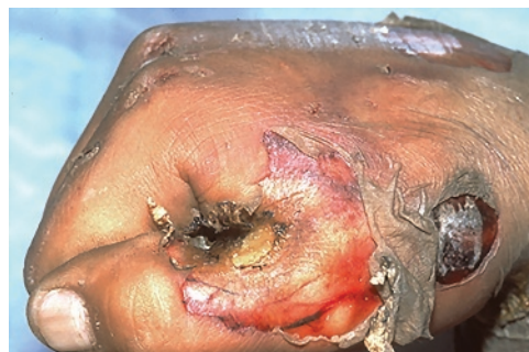
The extent of the injury underneath the skin is difficult to judge and needs to be explored.