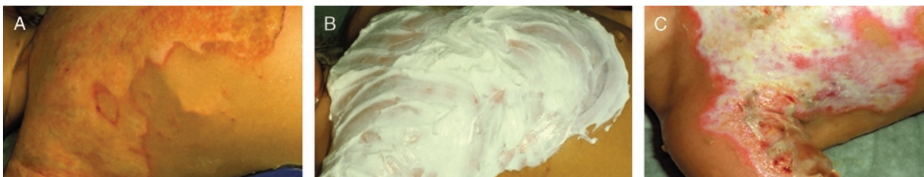
Figure 3. MIXED PARTIAL-THICKNESS BURN IN A TODDLER

A, Typical mixed partial-thickness scald, postburn day 1. B, A fresh layer of SSD cream is in place, postburn day 5. C, Secondary deepening on a wide scale, postburn day 12. This burn now needs to be excised and grafted.